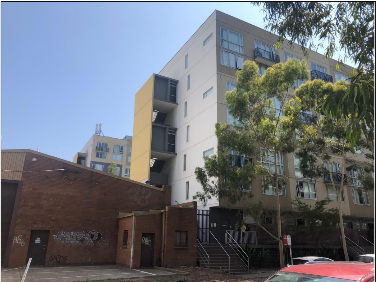
Figure 4 - Existing development at 10-12 John Street

A recently completed mixed use development adjoins the site immediately to the west at 27 Church Avenue & 18A John Street (shown in Figure 2 ). This building presents a blank wall along its eastern boundary which is shared with the subject site. Immediately adjoining the site to the west is 19-21 Church Avenue and 10-12 John Street which is a residential development comprised of three (3) separate forms/buildings across the site. See below: