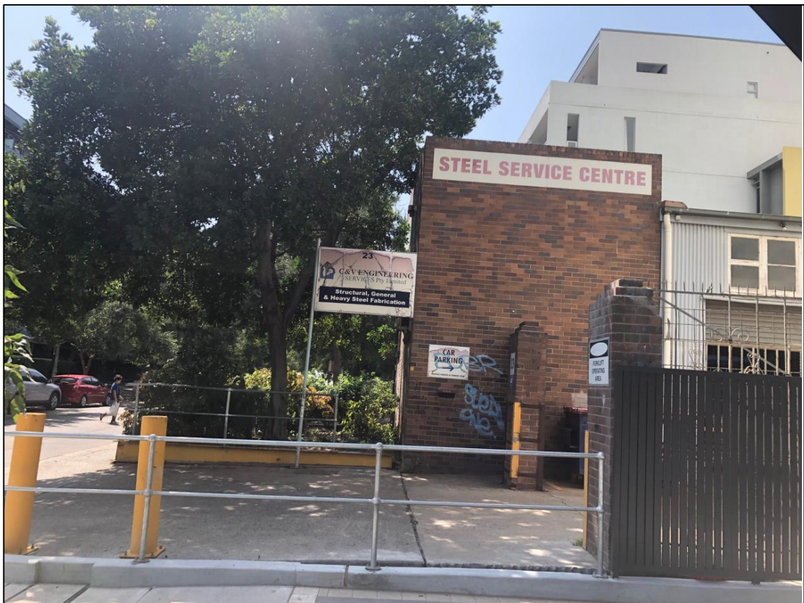
Figure 3 – Existing building at Church Avenue