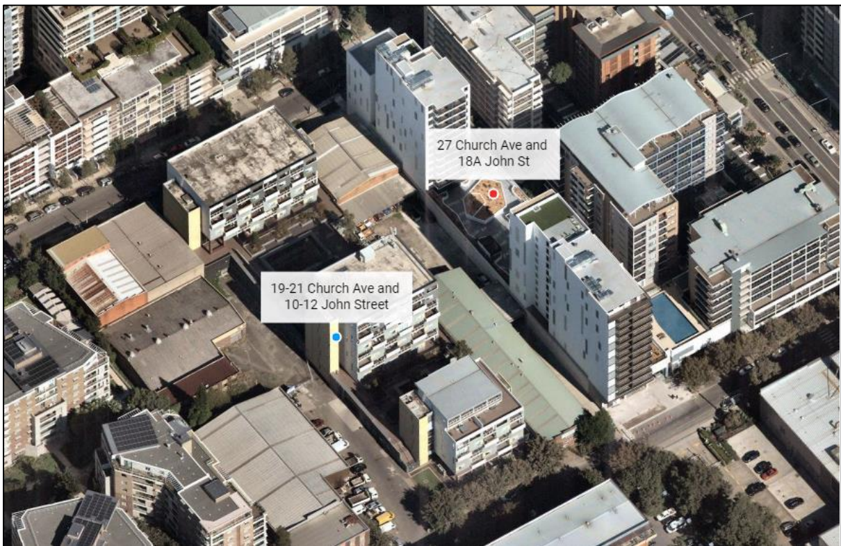
Figure 6 – Aerial view identifying neighbouring sites