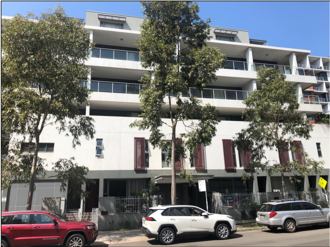
Figure 5 – Existing development on the opposite (southern) side of John Street