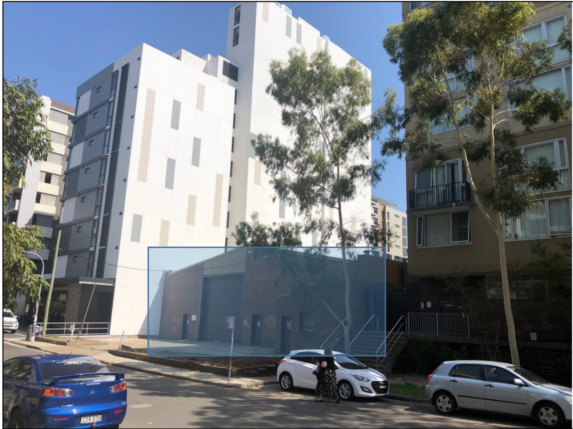
Figure 2 - Existing warehouse at 16-18 John Street